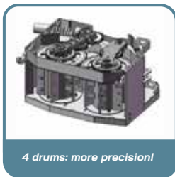
4 drums: more precision!