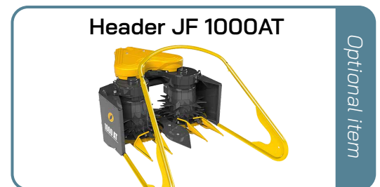
Header JF 1000AT