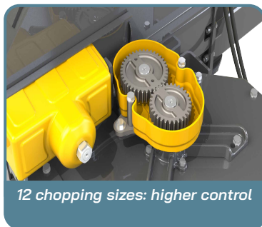
12 chopping sizes: higher control