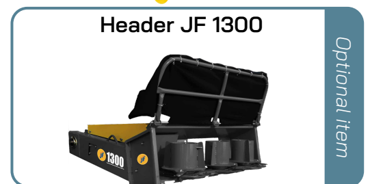
Header JF 1300