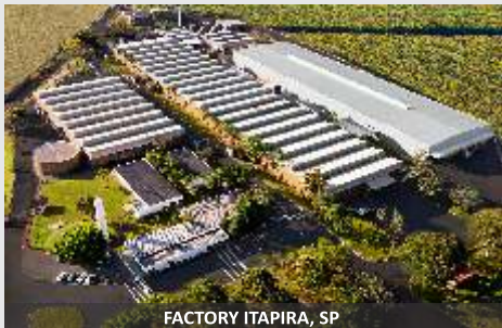
FACTORY ITAPIRA, SP

The most robust and best mixture of its class!