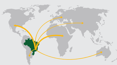
FROM BRAZIL TO ALL CONTINENTS OVER 50 COUNTRIES