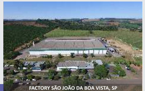
FACTORY SÃO JOÃO DA BOA VISTA, SP

Mixers Line JF, the solution for the farmer!