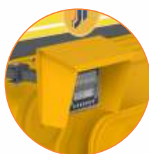
DG500 scale system