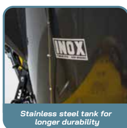
Stainless steel tank for longer durability