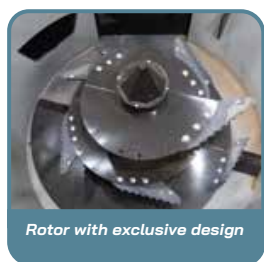
Rotor with exclusive design