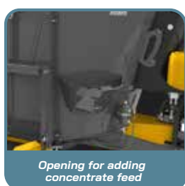
Opening for adding concentrate feed