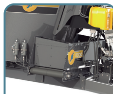
Discharge for both sides through conveyor.