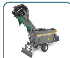
Self-loading system with high loading speed.