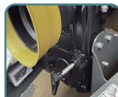
Planetary Transmission: 2 speeds